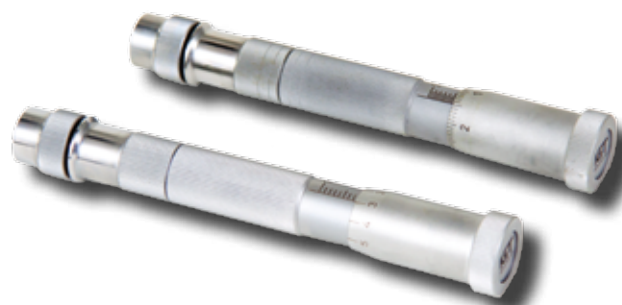
IGT Ink pipette

The IGT ink pipette is used to apply ink to the top roller. The ink pipette significantly increases the accuracy of the ink application and thus the results of the tests. Ink pipettes are available in resolution of 0,01 ml and 0,001 ml.