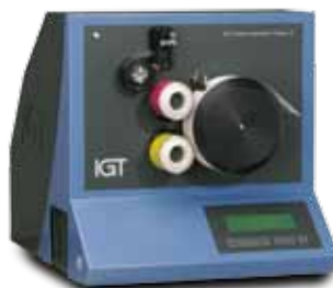
IGT Global Standart Tester 2