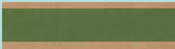
Flexo print on paper board to check colour, coverage and other dry properties