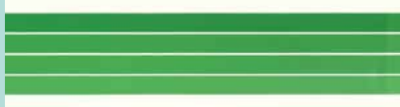
Flexo print of four bands to check the colour in four ink layers