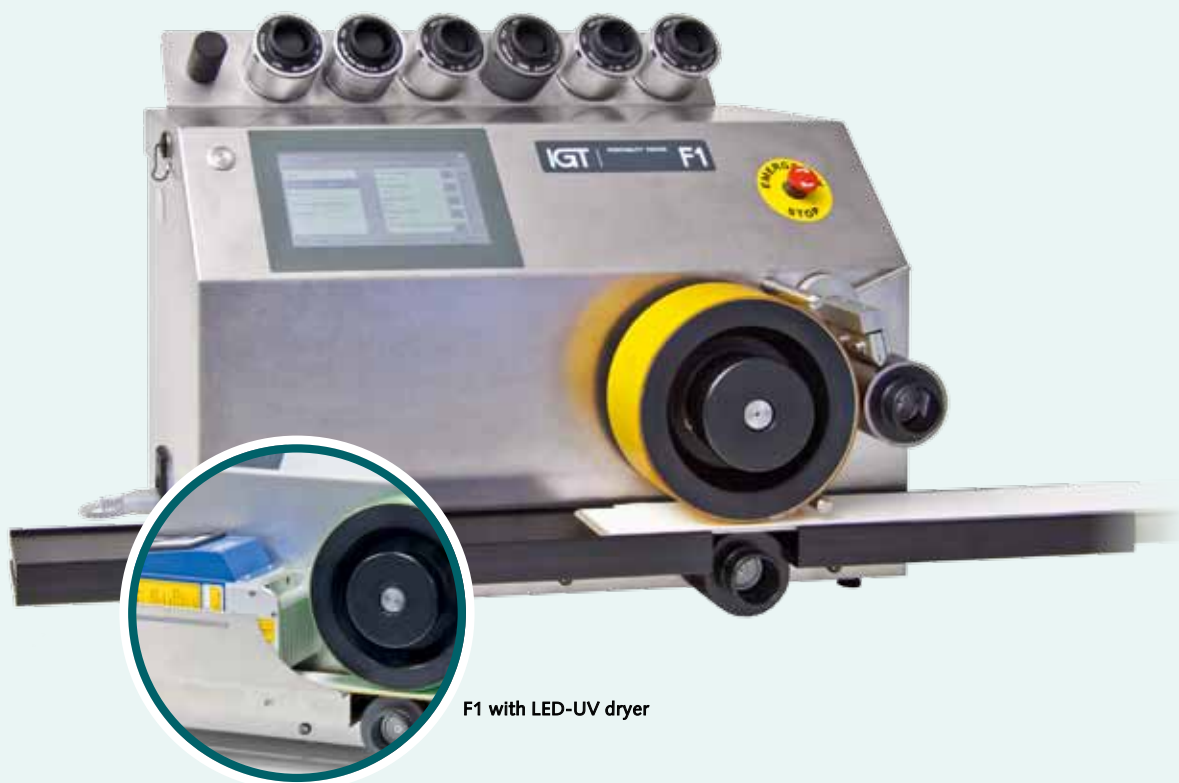
F1 with LED-UV dryer

IGT Testing Systems has developed the advanced computerised F1 printability testers for flexo and gravure applications. The F1 makes prints with flexo and gravure inks, which can be used for many purposes as computerised colour measuring and colour matching systems and printed electronics. The F1 saves on costs because colour testing on the printing press is no longer necessary.