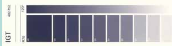
Gravure print to check the colour in ten coverages and/or to check the roughness of the substrate