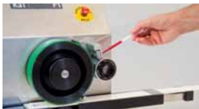
Applying the ink voor flexo printing

The low-cost version is the F1 Basic. In this version the printing speed can be pre-programmed from 0,2 to 0,9 m/s. The anilox/printing force can be programmed in three combinations between 20 and 500 N. The F1 Basic is used when there is no need to change the speed or anilox- and printing force once it is set to the optimal values. This tester is specially used in QC of inks and substrates.