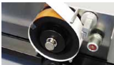
Mounting substrate for gravure